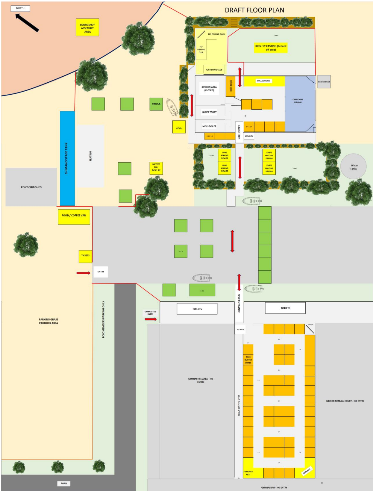
Site Plan (Draft Only) - See larger version HERE>>>

The final layout will depend upon the number of stalls we need to fit in.