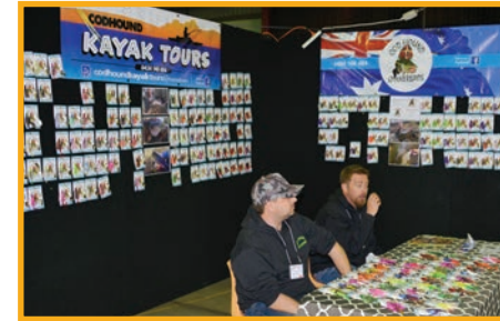
Sample 3m x 3m Premium Site