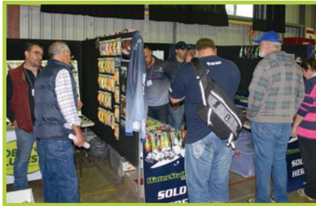
Sample 2.4 x 2.4m Standard Site

There are a range of indoor and outdoor stand options to suit your display needs. If you require more space please contact the show organisers to discuss your needs.